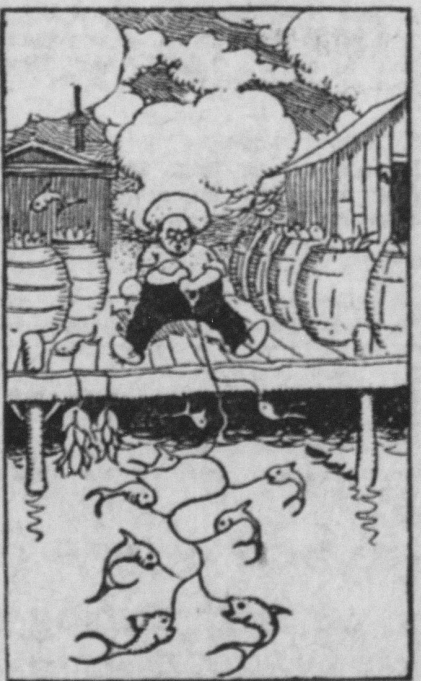
"I Have Caught Barrels and Barrels of Fish."