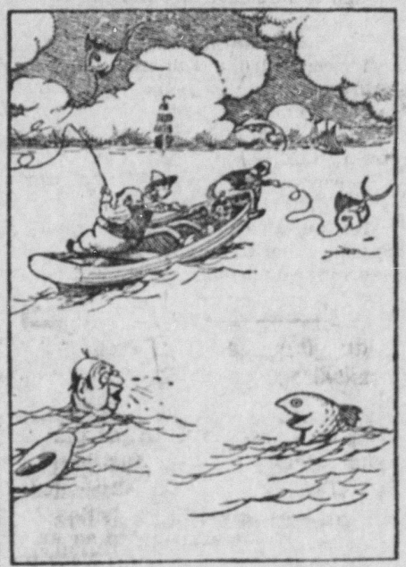
"One of the Men Fell Overboard."

The rope was cut and the boat proceeded on its way. Nothing occurred in the next half hour, except getting on shore twice and on sand banks three times. There was a schooner loaded with bricks coming up the river, and Mr. Bowser ran his boat very close to her to ask the price of bricks. The captain threw one of the missiles at him and called him the biggest fool on the river. Then a catboat, which was sailing peacefully along, and fearing neither man nor beast, got a bump from the motorboat, and the owner of the cat said he would meet Mr. Bowser some day and punch the head off him. Mr. Bowser made no reply. His unalloyed was too great to be interfered with by a scrap. He was sworn at and abused by his guests, but he was untroubled. The boat finally reached what Mr. Bowser believed was good fishing