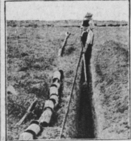
Digging the Ditch Preparatory to Laying the Tile.

Farm drains may be either open ditches, or tile, or a combination of