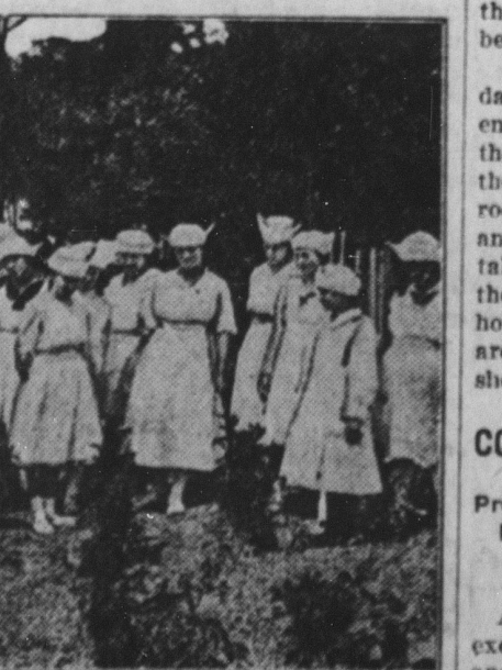
Gaining Club Girls Inspecting a Club Garden.

Supervision of boys' and girls' poultry clubs by the United States Department of Agriculture, in co-operation with state agricultural colleges, was continued during the last fiscal year in seven states, where there were 1-