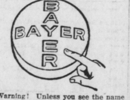
Warning! Unless you see the name "Bayer" on package or on tablets you are not getting genuine Aspirin prescribed by physicians for twenty-one years and proved safe by millions. Take Aspirin only as told in the Bayer package for Colds, Headache, Neuralgia, Rheumatism, Earache, Toothache, Lumbago and for Pain. Handy tin boxes of twelve Bayer Tablets of Aspirin cost few cents. Druggists also sell larger packages. Aspirin is the trade mark of Bayer Manufacture of Monaceticacidester of Salicycylol.—Advertisement.

Dead martyrs get most praise. SWAMP-ROOT FOR KIDNEY AILMENTS There is only one medicine that really stands out pre-eminently as a medicine for curable ailments of the kidneys, liver and bladder. Dr. Kilmer's Swamp-Root stands the highest for the reason that it has proven to be just the remedy needed in thousands upon thousands of distressing cases. Swamp-Root makes friends quickly because its mild and immediate effect is soon realized in most cases. It is a gentle, healing vegetable compound. Start treatment at once. Sold at all drug stores in bottles of two sizes, medium and large. However, if you wish first to test this great preparation send ten cents to Dr. Kilmer & Co., Binghamton, N. Y., for a sample bottle. When writing be sure and mention this paper.—Advertisement. Showing off costs about five times as much as comfort.