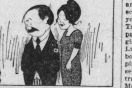
SUCH IS LIFE

"The Blinks and the Browns are both newly rich, but they don't associate." "Why not?" "The Blinks feel above the Browns. They made their money in refined sugar, while the Browns made theirs in crude oil."