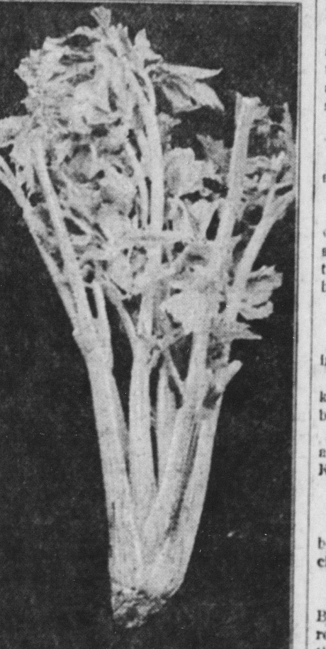
Healthy Stalk of Celery.

Celery plants should be sprayed with bordeaux mixture every ten days to two weeks to prevent leaf diseases, which often seriously injure the crop for market purposes. These leaf spots occur generally in celery-growing districts in the United States during cool, moist weather. Home-made bordeaux, composed of 4 pounds bluestone (copper sulphate) and 4 pounds stone lime to 50 gallons of water, is the cheapest and best fungicide for the purpose. The spraying should be begun while the plants are still in the seed bed and continued throughout the season. The sprays should be more frequent during moist, cool weather favorable to the development of the leaf spots.