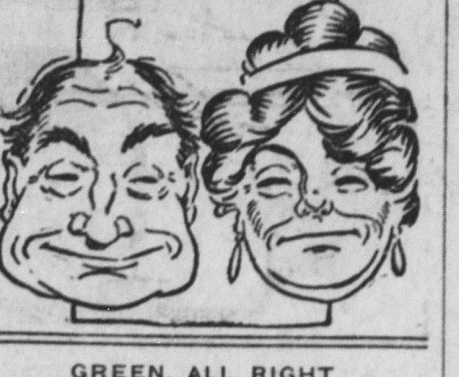
GREEN, ALL RIGHT.

A rather green looking chap went into one of our department stores the other day and, sauntering up to the counter, where dozens of men's caps were displayed, he looked carefully through the stock, but seemed unable to find what he wanted.