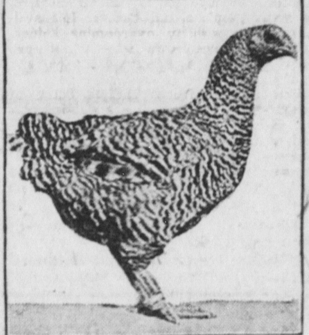
Barred Plymouth Rock.

In the absence of census data on the quality of farm poultry, information being received by the United States Department of Agriculture in connection with the Better Sires—Better Stock movement is believed to be of interest to poultrymen. For instance, of 75 livestock owners in Webster