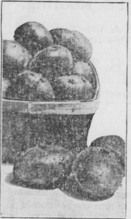
Good Potatoes of Uniform Size.

With the continuing drop in price, potatoes have receded from their temporary status of delicacy, and are assuming their old rank as a great American staple food. This is to be assumed from figures lately compiled by the bureau of crop estimates, United States Department of Agriculture, which shows that between harvest time and January 1, this year, 255,172,