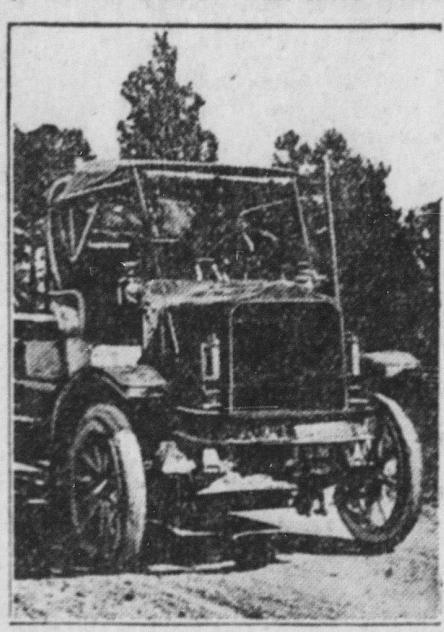
Motortrucks Properly Loaded Will Re duce Damage of Roads,

Given a perfectly smooth road surface, traveled by a truck with perfecty smooth circular tires, there would