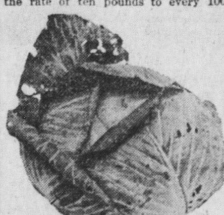
Good Solid Head of Cabbage.

Plant early cabbage in the richest part of the garden, having previously worked into the soil all the rotted manure that can be spared and then added high-grade commercial fertilizer at the rate of ten pounds to every 100