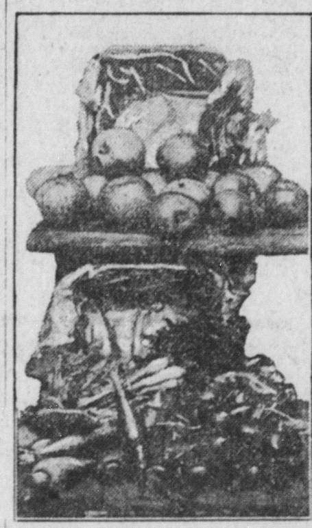
Products of Garden in New Mexico.

The United States Department of Agriculture reports that the following is a part of what was accomplished last year in this county under the supervision of the home demonstration