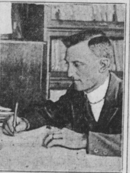
Preserve Farm Records—They May Prove Valuable.

A well-kept diary is the most interesting and valuable volume in its owner's library. For the farmer, the diary will preserve a record of farm happenings and personal experiences which will be valuable in the future conduct of his business. If, when he finds his alfalfa field swarming with grasshoppers, he can look back in his diary to a summer ten years before and find the poison-bait formula that controlled the insect then, he will save much valuable time. He may wish to know the exact location of a tile drain that was laid down when he was a youngster. If the event was noted in his own, or his father's, diary, a ten-minute perusal will give him more definite information than a day's digging with a spade. There are dozens of farm problems encountered every year that might be solved more