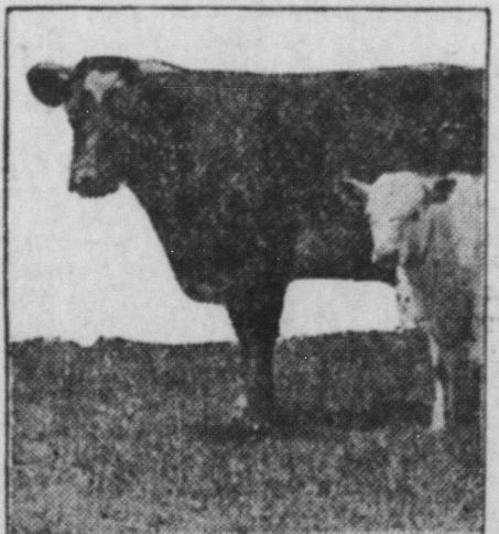
Select a Calf, if Possible, When It May Be Seen With Its Mother.

The calf which is selected must have good form, which is sometimes spoken of as type or conformation. To become familiar with types of the breed, study pictures of famous animals. Make use of a score card in selecting