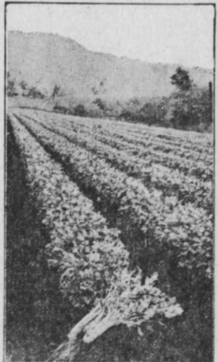
Celery in Field Almost Ready for Marketing.

The establishment of two grades of rough celery would eliminate much waste and would enable dealers and