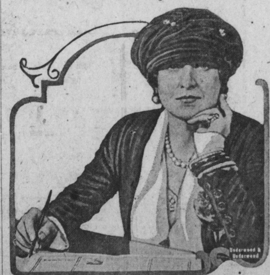
Mary Garden, the famous operatic star, photographed at her desk on her first day as general director of the Chicago grand opera. Her appointment to the important post caused much excitement in the musical and theatrical world.