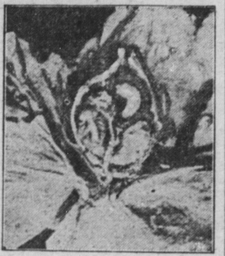
Larva of Weevil in Boll of Cotton.

(Prepared by the United States Department of Agriculture.) "Good-by, Boll Weevil," is the title of an entertaining and instructive two-reel film just released by the United States Department of Agriculture. Mr. Boll Weevil, destroyer of American crops to the extent of many million dollars a year, is the "heavy" villain. He appears several times individually in the course of this lively production, but the principal part is devoted to the activities of the hero of the sketch, Mr. Calcium Arsenate, who is aided and abetted by the department in his efforts to bring about