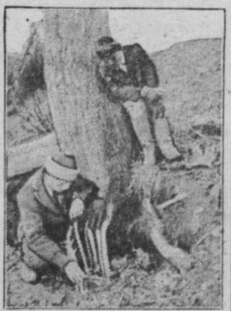
Traps Earn Spending Money for Many Country Boys.

Foxes often follow paths or trails and, taking advantage of these, the