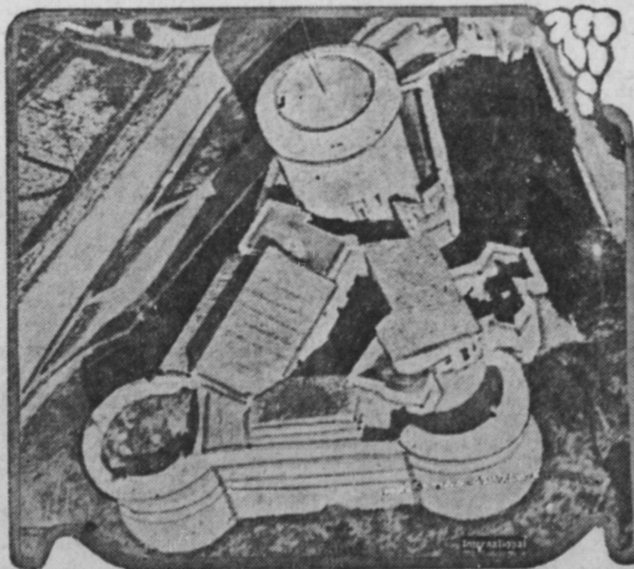
A castle built in the middle ages at Ostia, near Rome, as seen from the air. Of unusual design and architecture, the pile is one of the sights of Ostia, the Brighton of the ancient Romans.