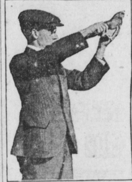
Starting the Bird on its Homeward Journey.

To Noah must be given the honor of owning the first homing pigeon of which there is written record. Although the olive tree from which Noah's dove or pigeon brought a sprig to him doubtless looked fair to the bird after the weeks of close confinement on the ark, yet that marvelous instinct for its home, which is one of the chief characteristics of the homing pigeon, brought it back once more to the boat afloat on the face of the waters. The Egyptians, Greeks and Romans all used the messenger pigeon in their days of power, and to