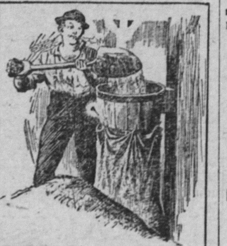
With This Arrangement for Holding the Sack, One Man Can Do the Work of Two.

This device for holding sacks while filling them should save backache and many useless adjectives. It is made of half a pickle-barrel with the ends knocked out, attached by a small block of wood to the side of a bin or granary. Five or six nails driven through the sides of the barrel from the inside and pointed at an upward angle when the barrel is in place, hold the sack in place during the filling. The sack is