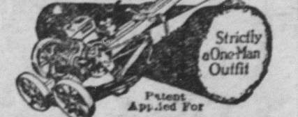
The Improved Model, 4-H.P. Ottawa Log Saw.

A new improved power log saw, now being offered, outdoes all other log saws in cutting wood quickly and at little cost. A new 4-cycle, high power motor equipped with Oscillating Magneto—no batteries to fail you—makes the saw bite through logs faster than other log saws. It finishes its cut and is ready for another before the ordinary saw is well started. This log saw—The Ottawa—has a specially designed friction clutch, controlled by a lever, which starts and stops the saw without stopping the engine. Others have imitated, but no other power log saw has this improvement just like the Ottawa. The Ottawa Log Saw sells for less money than any power saw of anything like its size.