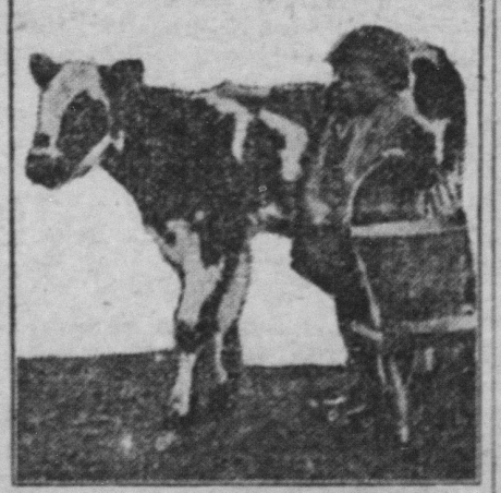
Starting Early in Dairying.

Be Careful With Gruel. Most dairymen get their calves gradually to eating some kind of calf meal fed in the form of a gruel, but many make the mistake of feeding too large a quantity of this gruel, thinking that it is not as wholesome as milk, and that they must, therefore, feed more of it to make up for the food value of the milk. This causes indigestion, and the calves become pot-bellied. The better practice is to feed from six to