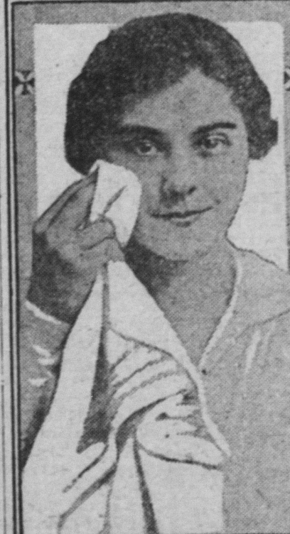
Never Let the Skin Become Harsh or Coarse in Texture.

BEAUTY CHATS by Edna Kent Forbes A DAINTY SKIN A BEAUTIFUL skin will do more than any one other thing to make a woman beautiful. For a beautiful skin is the barometer of health and well-being. It is clear with a soft coloring, it shows that digestion is good, that exercise, bathing, right living, have all helped to build up a