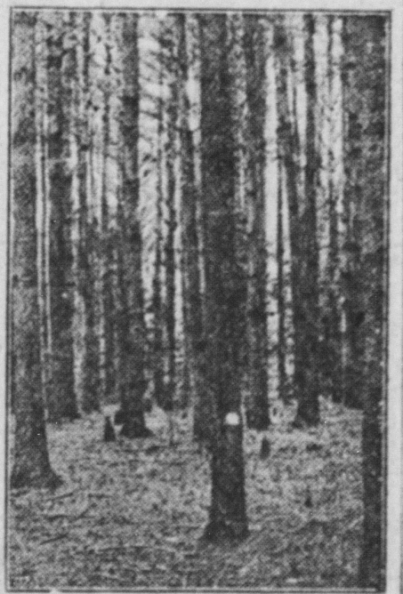
Farm Woodland After Thinning.

Not Needed for Crops. The Forest Service agreed to make an appraisal of the timber and to assist in drawing up a contract and sale conditions. The appraisal was made last spring and a price fixed of about $3.50 per thousand feet. Although the land is well adapted to agriculture, it will not be possible for the owners to put all of it into cultivation for a number of years. Consequently it is to their advantage to devote it to growing timber until such time as it is needed for raising crops. The stand consists of yellow pine of a good quality and contains a large number of trees just below merchantable size which will make rapid growth when the old timber is removed. It is distinctly a case where it will pay the farmers to grow trees. These facts were explained to the members of the association and they quickly saw the advantage of handling the forest in the manner recommended.