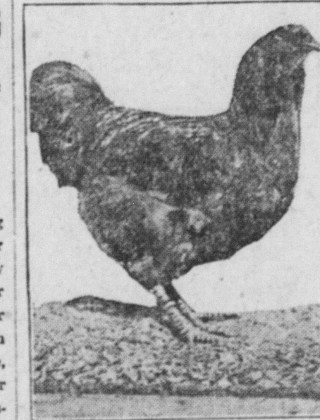
Good Specimen of Capon.

Capons should always be dry picked, as they look much better and as some of the feathers should be left on. The feathers of the neck and head, the tail feathers, those a short way up the back, the feathers of the last two joints of the wing, and those of the leg, about one-third of the way from knee to hip joint, should be left on. These feathers, together with the head of the capon, serve to distinguish it from other classes of poultry on the market, and consequently should never be removed. In packing, be careful not to tear the skin. Bad tears, poultry specialists of the United States department of agriculture say,