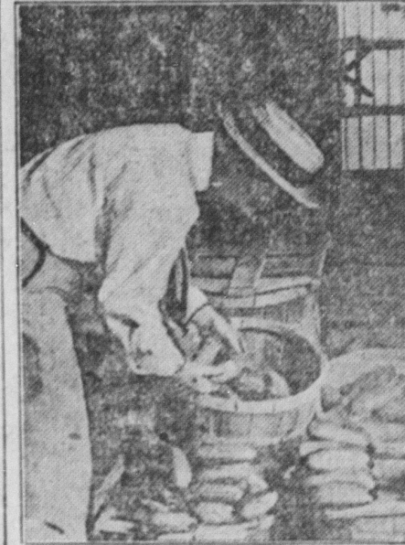
Federal Inspector Ascertaining Condition of Shipment of Cucumbers.

More than 25,000 inspections of fruits and vegetables moving in interstate commerce were made by representatives of the bureau of markets, United States department of agriculture.