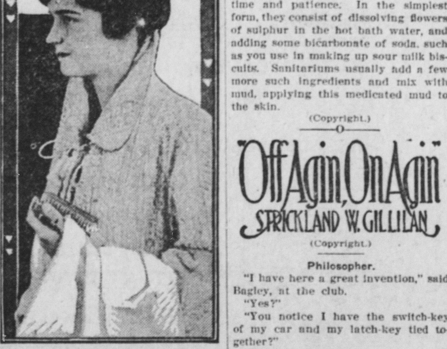
Oatmeal Baths Are Good for the Skin; They Make it Soft and White.

So, since our space is brief, I think I will make a list of the various