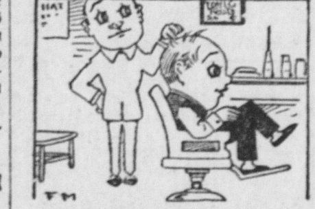
A NATURAL RESULT

“Our waitress has an interesting face.” “Umph!” “I'd like to know the history of her life.” “I'm not interested in the damsel's career previous to the time we came into this place for a bite to eat, but I've noticed that her life for the past twenty minutes has been one of haughty repose.”