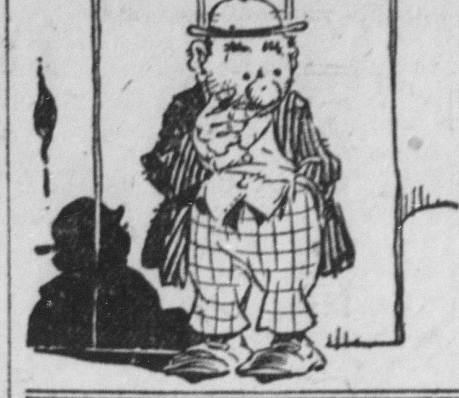
BENEFITS IN DISGUISE.

“This house is rather old, isn't it?” said the prospective tenant. “Oh, no,” assured the real estate agent. “This house is comparatively modern.” “But these stairs creak terribly,” complained the prospective tenant. “Oh,” explained the agent, “that is the latest modern improvement in homes. That is a patent burglar alarm staircase. No burglar can get up to the bedroom floor without waking you up.”