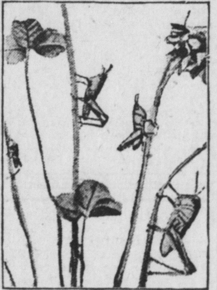
Young Grasshoppers Feeding on Clover.

Grasshoppers are infesting the farms in the northern portions of North Dakota, Michigan and Oregon east of the Cascade mountains, according to reports received by the bureau of entomology. In the Dakotas the situation is particularly serious because the farms have suffered from several years of drought, and the average farmer's bank account is much decreased by these years of extremely low crop yields. Now comes the grasshopper to destroy the first good crop the farmers have been able to grow since the beginning of the extended dry seasons. In many cases the farmer's predicament is desperate.