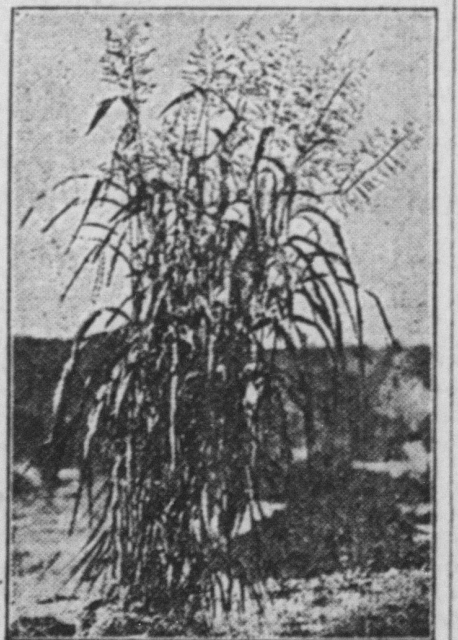
Sudan Grass Grown in Rows and Cultivated.

There are certain parts of the United States where the department of agriculture considers it unwise to depend on Sudan grass for hay. This is true of the strip of territory 200 miles wide along the northern boundary; the regions of high alti-