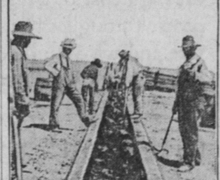
Dipping Sheep in Cement Vat.

It is also essential that the second dipping take place before any mites which may hatch out after the first