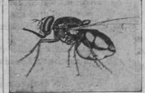
Adult Female Stable Fly, Showing Body Enlarged With Blood.

The adult stable fly resembles the house fly, but is slightly broader and feels principally on the blood of animals, which it draws with its long, piercing mouth parts. It breeds in accumulations of various kinds of vegetable matter and also in manure, especially when the latter is mixed with straw. When straw stacks become wet