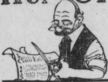
COULDN'T BE HAPPY.

"Your wife says she is entirely happy," said the spiritualistic medium. "I don't see how that can be," replied the man. "She is in heaven," replied the medium. "There she would naturally be happy." "I don't think so," replied the man stubbornly. "I don't see how she could ever be entirely happy without me being around to find fault with."