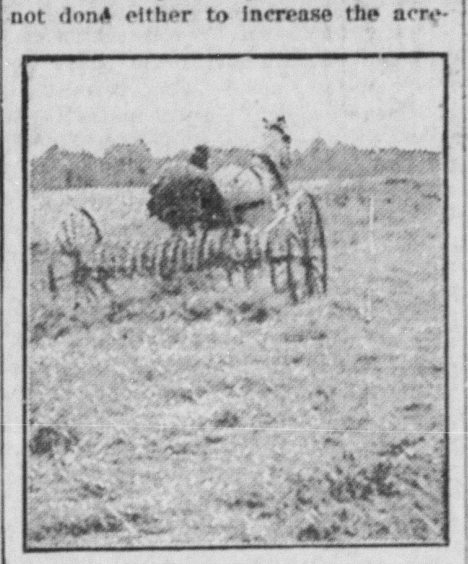
Raking Crimson Clover Hay in Del aware.

Less planting of clover has injuriownership and use of motor trucks ously affected the productiveness of