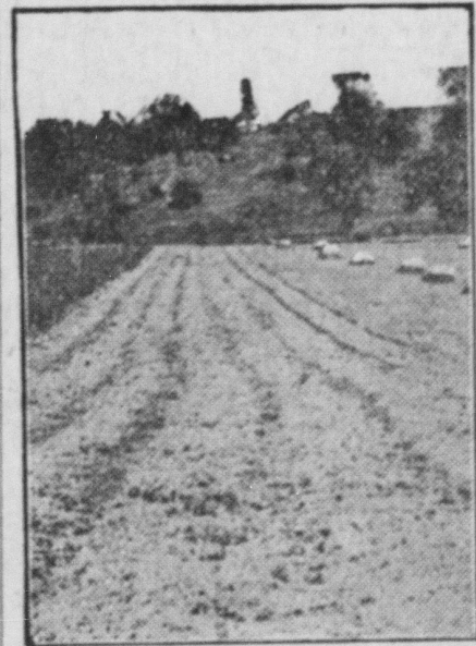
Alfalfa is the King of Forage Crops.

Manure Good for Alfalfa. The misconception is wide that none but thoroughly rotted and weed-free stable manure should be applied to the field which is to be broken and seeded