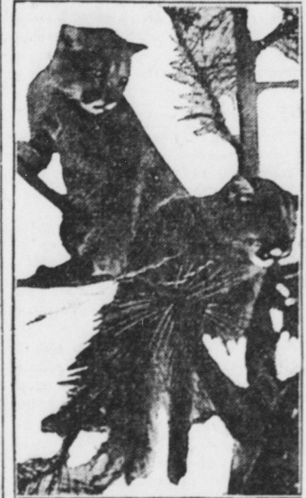
Half-Grown Mountain Lions Snapped in Top of a Yellow Pine Tree—There Are Still a Considerable Number of These Animals in the West Which Have Eluded the Hunters.

Extensive poisoning operations were conducted in the great sheep-growing sections of Arizona, Colorado, Nevada, New Mexico, Utah, and Wyoming. This was followed by a marked decrease in the number of coyotes, particularly with a corresponding decrease in the losses of sheep, cattle,