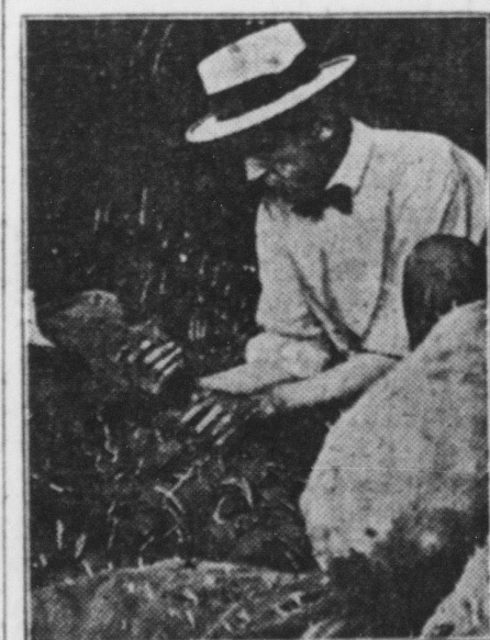
Federal Inspector Inspecting Carload of Badly Sprouted Potatoes.

WHITE LEGHORN BEST LAYER Average Total Production of Eggs During Life is About 500—Profitable Four Years.