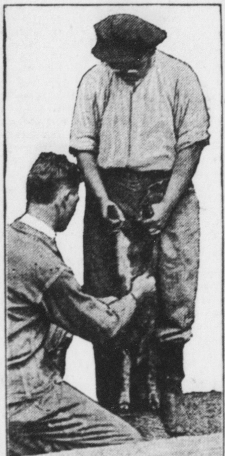
Flank Injection—Proper Handling of Hog Cholera Treatment is Absolutely Essential to the Checking of the Disease.

The tendency of laymen to engage in the diagnosis and treatment of diseases of live stock is in a great many instances resulting in losses of animals through inability to properly recognize ailments in time to apply needed treatment, or through applying remedies not indicated in the specific cases. This is particularly dangerous in the handling of infectious and contagious diseases where not only the original herd is at stake, but where,