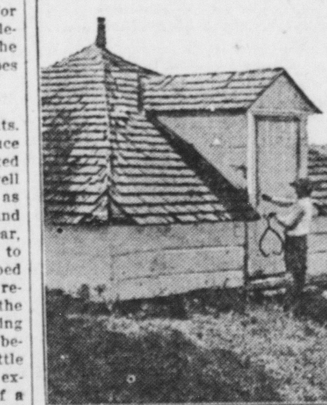
A Farm Ice House.

It's getting late now. Soon sap will be running and buds swelling. You can't afford to wait any longer. This