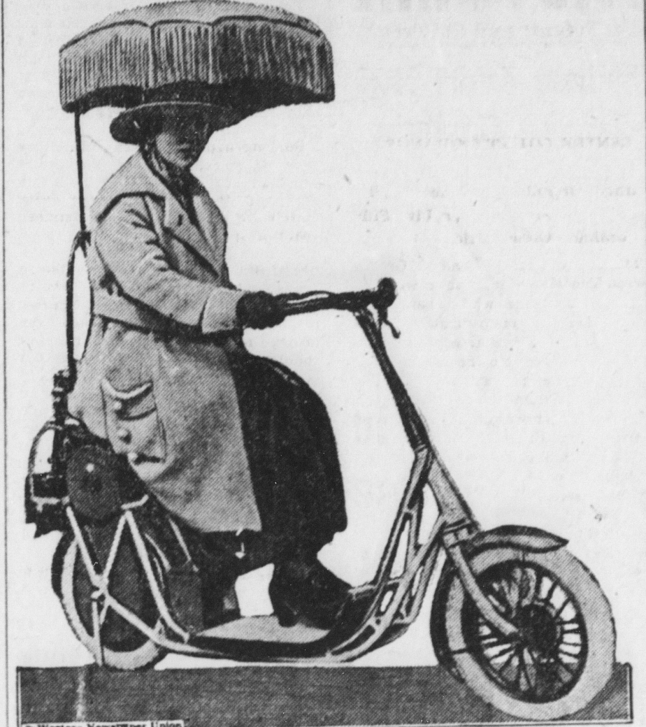
A "Tropical Skootamotor" exhibited at the recent motorcycle show at Olympia, England. It is shown in the photograph. Quite popular in the streets of London at present, this unique little device may invade our shores, and the model shown above, designed especially for tropical use, may become a fad at such winter resorts as Palm Beach, Miami, etc.