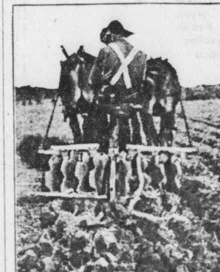
The Disk is the Implement Most Commonly Used in Preparing a Seedbed for Oats.

The date of seeding naturally depends on the locality and season. In the corn belt the best date is usually from about March 25 to April 15. In the more northern states seeding during the latter half of April is advisable whenever conditions permit. In favorable seasons seeding before the middle of April frequently can be done