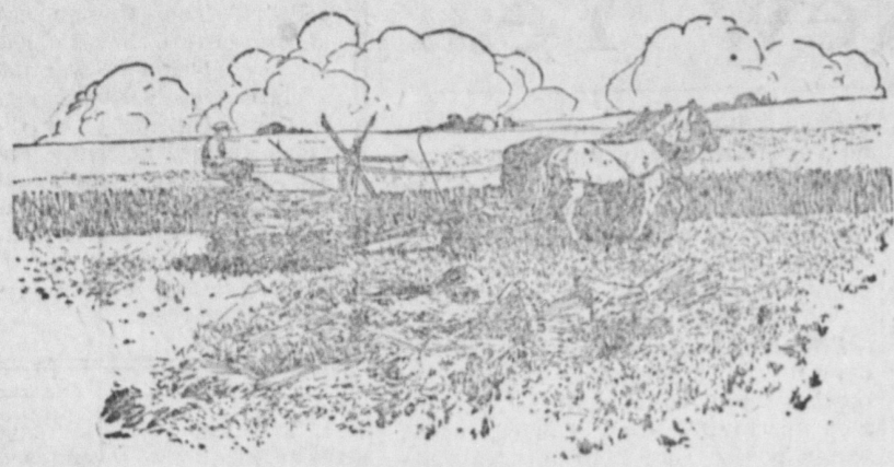
The Most Reliable Harvesting and Haying Machines