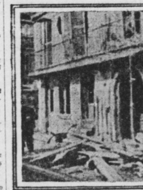
The Way the Germans Destroyed Homes.

But that was just the beginning. When I saw another man in one of those rat-colored costumes pull the mattress off my crib and take out its wool stuffing I was mad clear through. And then I looked around and saw they were doing the same thing to my mother's bed. They took most of the blankets, too. But what could we do? My father wasn't there, because he had gone somewhere else to fight and I was the only man in the house. I had tried kicking that German when he first picked me up and I realized he was too big for me to handle. We hoped that one raid would be the end of it, but it wasn't. Well, to