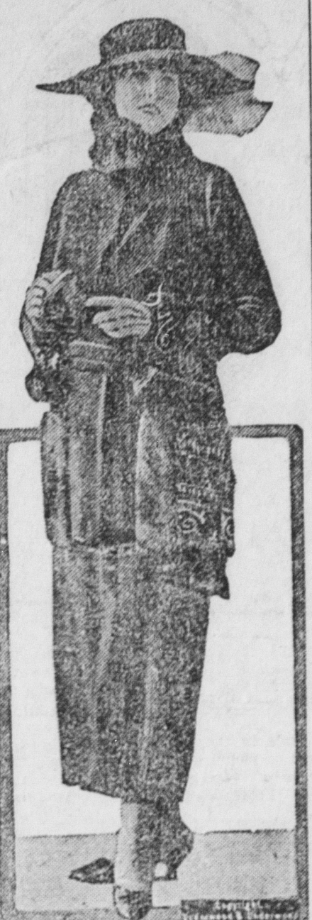
This tailor of cocoa peach bloom is cut along rather severe lines, but is rendered quite elaborate by silk embroidery and bands of kolinsky. Wide embroidered cuffs on the tight sleeves are a pleasing feature.