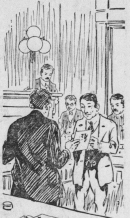
"Well, What Does This Say?"