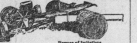
Beware of Imitations.

Only one man, or even a boy, with the improved Ottawa Engine Log Saw can easily cut twenty-five to forty cords a day, and at a cost of less than 20 per cord. This machine, which outdoes all others, has a heavy, cross cut saw driven by a powerful especially designed 4-cycle gasoline engine. It's a fast money-maker for those using it, and does more than ten men could do, either cutting down trees, sawing logs, or buzzing branches while you rest. When not sawing, the engine can be used for other work requiring power.