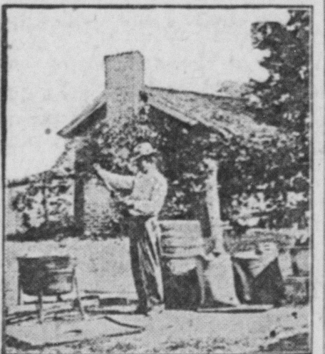
Protecting Seed Wheat Against Smut by Formaldehyde Treatment.

Smut in Steuben County. The county agent of Steuben county, in company with a representative of the United States department of agriculture, found one field of wheat with as much as 84 per cent of smutted heads, and considerably more than 50