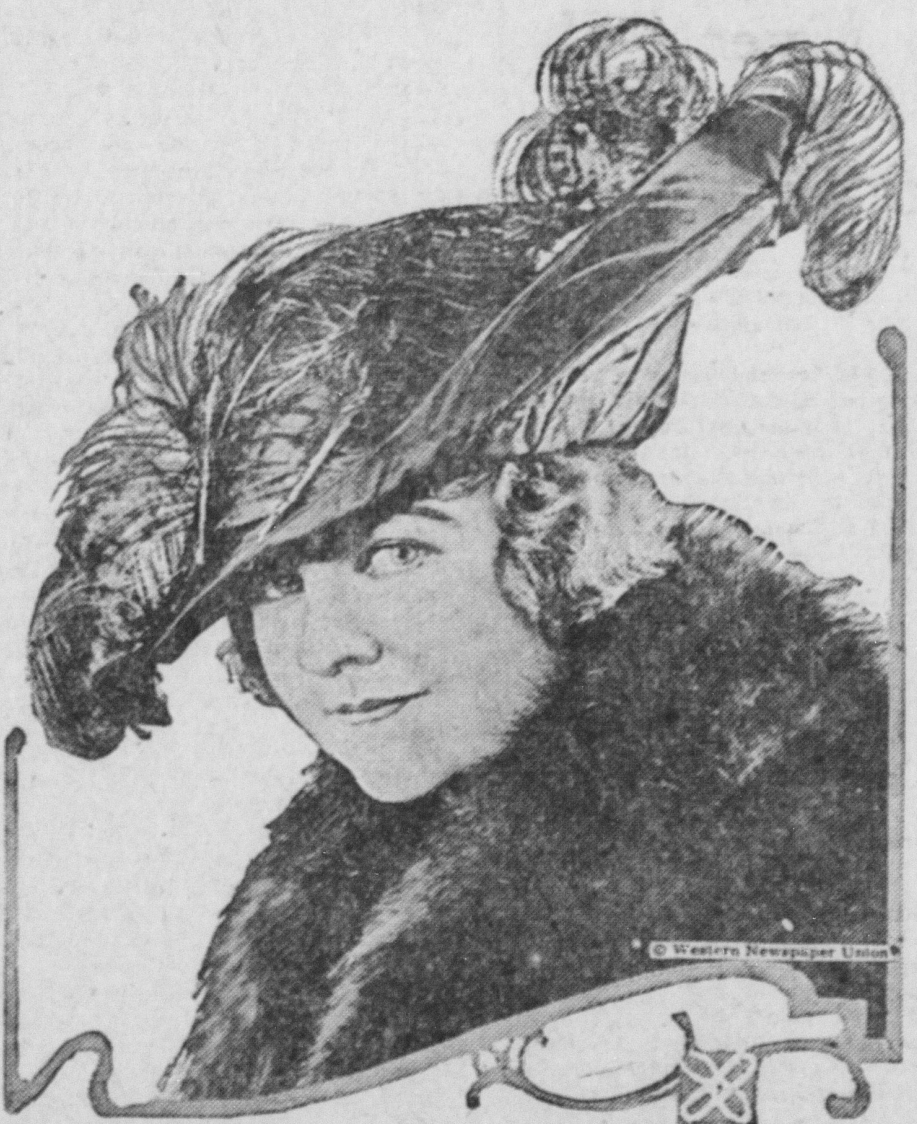
An afternoon hat of unusual merit. The skeleton ostrich feathers make a striking trimming for this exquisite headgear of velvet.

Favorite Color Combination. Black and white is by all odds the favorite color combination at the French resorts at this time of the year. Black and white stripes, since early spring, have been very good for sep-