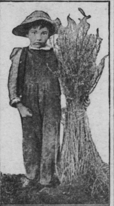
Alfalfa is Highly Regarded as a Forage Crop.

Best Control Measures. The best control measure consists in timely cutting of the alfalfa crop, so as to remove the food supply when the caterpillars of this insect are most abundant. Clean culture is also recommended, and when outbreaks are particularly bad the use of the hopperdozer is advisable.