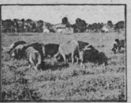
A Bunch of Mortgage Lifters.

Even greater than the record number of breeding sows on farms in the United States a year ago, the number on April 1 this year reached the unprecedented total of 9,970,000, according to the bureau of crop estimates, United States department of agriculture. While the average gain for the whole country over last year is only 0.3 per cent there were gains greater than this in most of the states and as high as 8 per cent in California. Diminished numbers in the great swine states of Iowa, Missouri, Nebraska, Louisiana and Oklahoma are sufficient to leave barely a gain to the United States as a whole. Under the pressure of the necessities of the war the breeding sows on farms April 1, 1918, had been raised 9.5 per cent over 1917, a remarkable