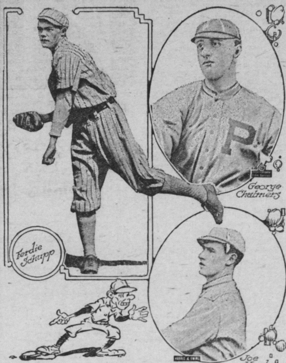
Pitchers With Deranged Hurling Apparatus.

Pitching arms are as fragile as Dresden china. More than one young flinger rearing the crest of his career has had to pop out of the pastime because he was unfortunate enough to derange his hurling apparatus.