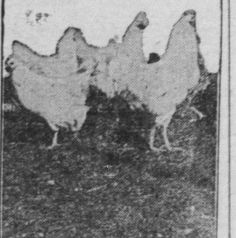
Best Plan to Keep Confined Fowls Busy Scratching for Their Food.

For those who cannot conveniently feed their fowls early in the morning