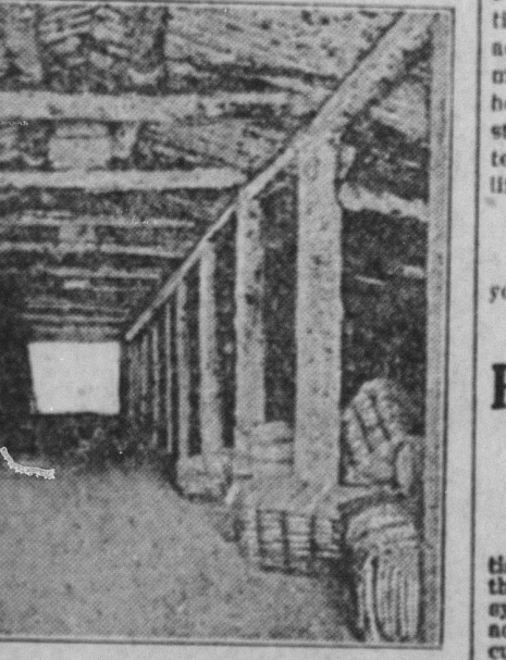
Interior of Satisfactory Potato Storage House With Earthen Side Walls.

Importance of modern sweet potato storage houses, such as have been designed by the United States department of agriculture, in which potatoes can be kept with practically no loss, is shown by the enormous waste resulting from improper storage. South