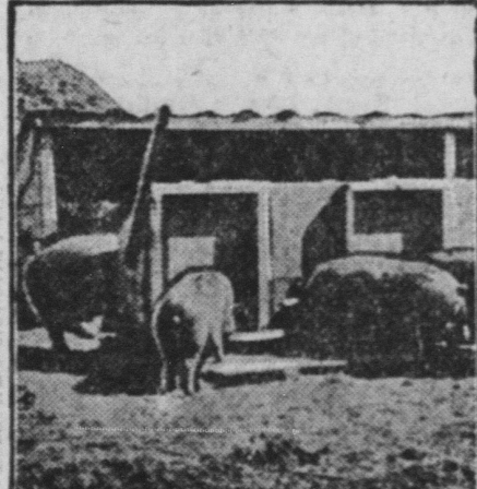
Pigs Getting Their Dinner at a Self-Feeder.

Where young pigs have access to corn, shorts, middlings, tankage, or fish meal, served to them cafeteria style in a self-feeder where they can eat it at their pleasure without being disturbed by other hogs, the youngsters can be weaned at the age of