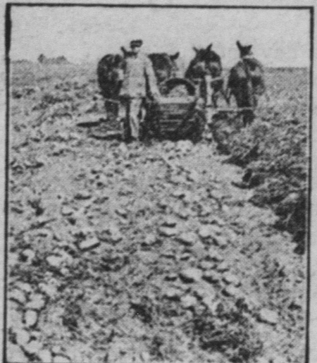
Digging Potatoes on Colorado Ranch.

plant 20 acres to potatoes, it would be necessary, to obtain an ample seed stock, to weed undesirable plants from at least two acres. Time required for this work would be comparatively little.