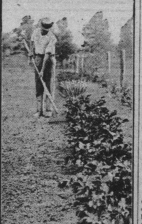
Keep the Garden Growing Through the Summer.

Too often gardens with a "seedy" appearance are seen in the middle of the summer. The brush on which the peas were grown or the wire trellis on which they were trained is left with the remains of the crop upon it, and general unsightliness rules the entire plot. It is a little more trouble to keep things neat and attractive, but it pays in the long run; and if you as a gardener want to maintain a reputation