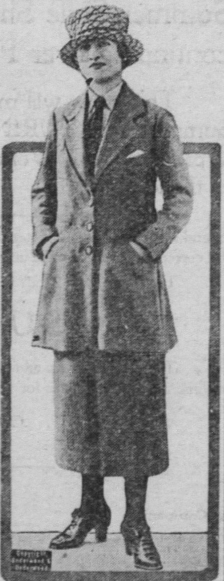
Suit of Gray English Tissue.

The new suits are distinctive in several ways. Coats are just finger-tip length, as a rule, and many of them have the loose outside pocket effect, achieved by turning up the bottom of the coat at the sides and in front. The skirts are narrow, as rumor predicted that they would be. The more extreme models have made allowance for the wearer's need, either by slitting the skirt at the back seam for a few inches up the hem, or, in one case, by making the skirt with the front and back widths absolutely separate as far up as the hips; these two sections were then caught together at intervals