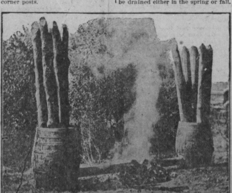
Treating Posts With Creosote.

A very satisfactory outfit for treating posts consists of an upright cylindrical tank for the hot treatment and a horizontal rectangular tank or vat for the cold bath. For applying the hot creosote to the butts one of the larger-sized gasoline or oil drums, about 27 inches in diameter, is very satisfactory for small operations, but for larger or co-operative treatment a cylindrical steel tank 3 feet in diameter by 4 feet in height should be used. In either case there will be needed a horizontal steel tank about 3 feet across by 3 feet in height and 8 feet in length, or large enough to accommodate the corner posts.