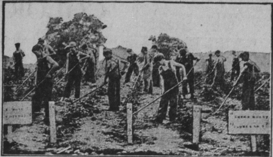
Club Members Learn More Than Principles of Agriculture.

(Prepared by the United States Department of Agriculture.) Agricultural production is not the sum total of achievement by members of boys' clubs in the South. Those youngsters below the Mason-Dixon line raise good crops; also, they raise fine baby hoes and standard pigs. Their sheep are of accredited breeds; their poultry is of the better types; and the gardens they cultivate are model gardens, many of them yielding very worth-while produce. In dollars and cents, the result of those boys' efforts annually mounts up to many thousands; in food supply it is of incalculable value to the 15 Southern states. But this is only part of the story—a bare enumeration of some of the activities of those Southern lads. The other part is, or should be, more interesting, for it deals with intangible commodities—character, high ideals, educational aspirations, civic pride—evolved from and developed through the training received in boys' clubs. In its effort to strengthen the agricultural extension organization the United States department of agriculture cites some instances to show the benefits of the boys' club work in the South.