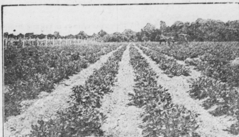
FIELD OF PEANUTS GROWN FOR FORAGE IN TEXAS.

(Prepared by the United States Department of Agriculture.)