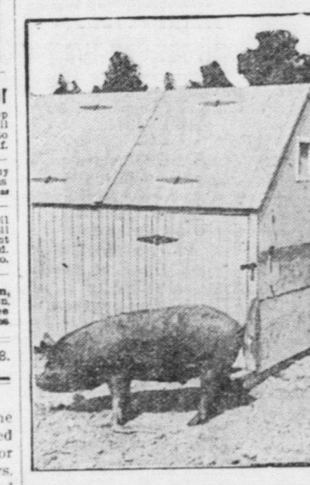
Good Type of Individual Hog House—This House Has a Number of Windows and Doors Which Can Be Opened to Provide Ventilation When Weather Conditions Permit.

Make Quarters Comfortable. Let it be remembered that the hog has little natural protection from cold; hence the necessity for comfortable