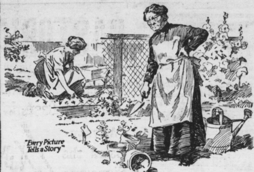
Every Picture Tells a Story