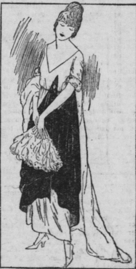
The material used in this evening gown is supple satin in pink and mauve orchid tones. The bodice is cut in irregular points over hips, and there is a wattleau train dropped from the shoulders. The short sleeves are finished with chinchilla.

As for the ostrich feather in America, it is slowly making its appearance, but it is sponsored by so many good houses that no doubt it will appear