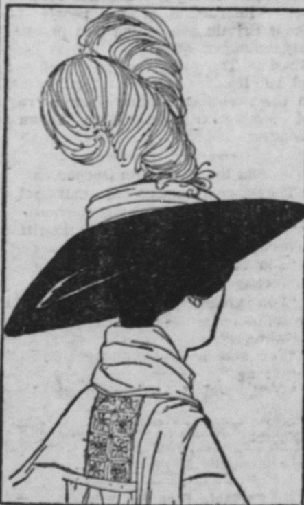
Four-cornered black velvet hat with crown of horizontal blue ribbon. Upstanding ostrich plume also in blue.

Belts Are Buttoned. The use of wide belts is almost universal, and they are buttoned, instead of being tied, as were true of the models shown last year. Both metal and celluloid buckles are used on belts, but for ornament instead of use.