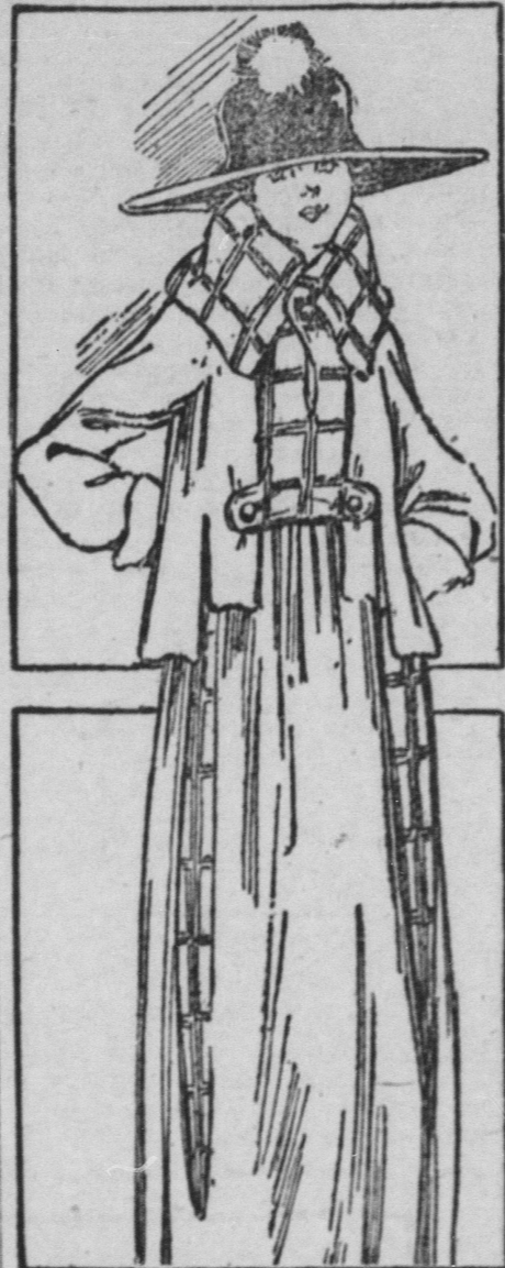
Coatee and Skirt of "Tete de Negre."

Paris.—This year the season at Biarritz has opened quite brilliantly. Everyone is cheered up by the arrival of the splendid "Sammies," who are already