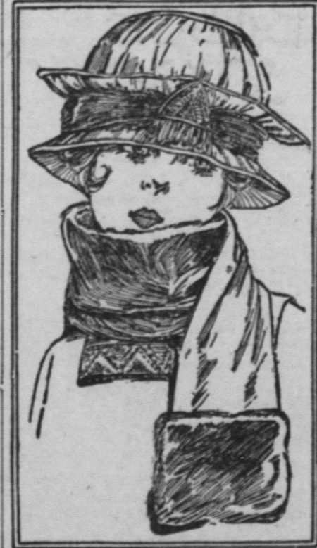
Smart Hat for Autumn.

This is one of the very new shapes and entirely satisfactory. The hat is quite small, with a cloche brim and a corded silk crown. It was to accompany a smart tailored suit made of lavender cloth which was trimmed with bands of squirrel. The coat of this suit was finished with a straight, throw-over tie made of cloth and fur. These throw-over ties are the latest