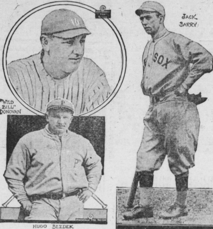
THREE MANAGERS WHO FAVOR PECULIAR PLAY.

Bill Donovan of the Yankees, Jack Barry of the world's champion Red Sox and Hugh Bezdek, the new manager of the Pirates, are frequent users of the squeeze play. In the first few games of the season the Red Sox conquered the Yankees twice by using this method of scoring. Since then Donovan has worked the squeeze play often and has won a number of close battles with it. Bezdek signals for the squeeze play nearly every time a runner reaches third with only one or none out.