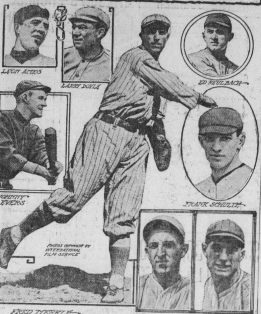
OLD-TIME CHICAGO AND NEW YORK PLAYERS

When Fred Merkle went to the Cubs he found not a single player who was with the team in 1908, when the Cubs won the pennant from the Giants through Merkle's oversight in not touching second.