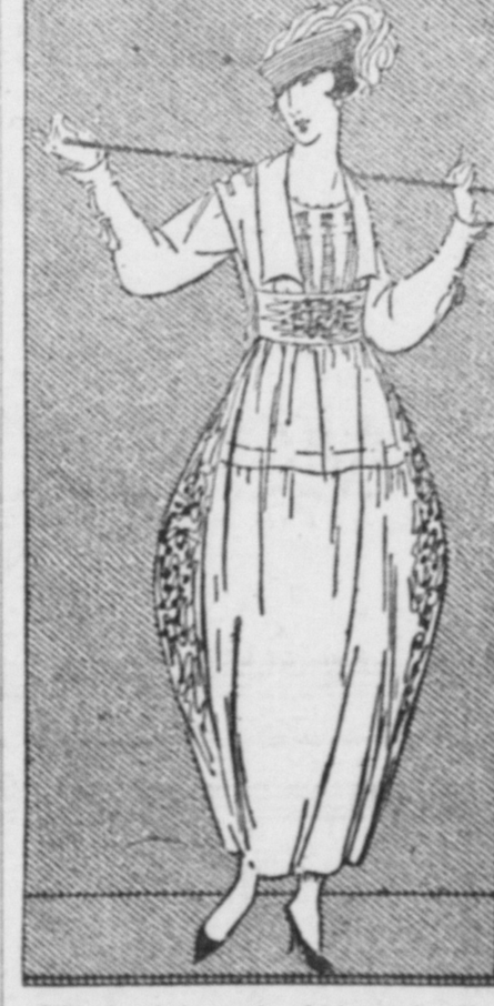
This frock is made of blue gaberdine and the curve at the knees is accentuated by machine stitching in blue and embroidery in blue beads. The short cape buttons on the shoulder. The fancy vest is of white organdie.

The weave that does not indicate by its appearance that it was ever intended for smart and expensive apparel is the weave that is accepted. There is a French quality that cannot be duplicated in this country, the dressmakers say, and the woman who orders a suit or frock of it pays a good fat price for it, with the satis-