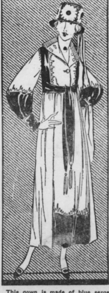
This gown is made of blue serge trimmed with black satin. The sleeves are barreled and built of the two materials joined by soutaching. The turnover collar is faced with natural shantung.

One of the best of the jersey frocks, which was instantly snapped up by the American woman, is a combination of black and cafe au lait. The top of the skirt is of the latter color and is slightly held in at the waistline so that it will not stretch in an ungainly manner across the hips and spine. It is cut off across the hips in a sharp line that turns and outlines a panel in the back. The lower half of the skirt is of black jersey, joined to the top in such a manner that it gives a slight barrel effect and then curves in to the ankles and falls in an irregular line at the hem, which is the prevailing note of the really smart frock. The slim bodice clings to the figure like the