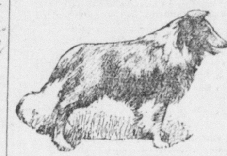
Friend of Any Farmer.

The first essential in breaking a dog for any purpose is to teach him to mind. Dogs are intelligent and affectionate animals and are usually gratified to do the will of their master. If possible, an animal should be broken to mind without fear of punish