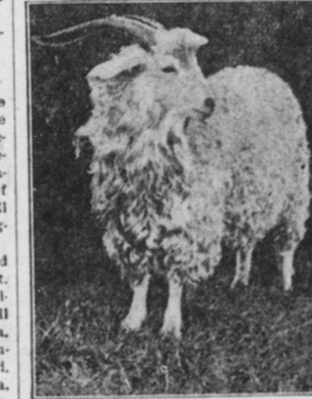
Champion Angora Buck.

The meat of goats, especially Angoras, is eaten to a large extent, being commonly sold under the name of mutton, and more recently bearing the name of Angora venison, or Angora mutton. If the goats are well dressed it has perhaps a more delicious flavor than mutton, and seldom has as much fat. In certain localities