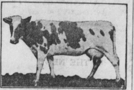
An Excellent Milker.

6. Discard the animals which have failed at the end of the year to pay for their keep.