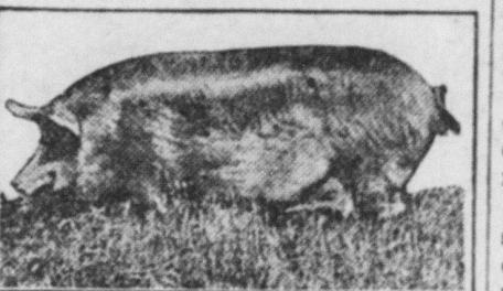
Highly Developed Tamworth.

Diseases which are most frequently mistaken for hog cholera are intestinal worms, various digestive disturbances, lung worms, inflammation of