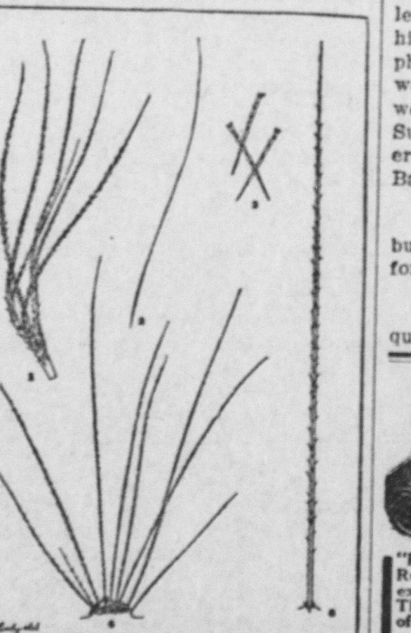
Various Forms of Hairs From Brown-Tail Moth Caterpillar.

Men who come in contact with these poisonous hairs during their work in the parasitic laboratory in Massachusetts, use the following remedy for the brown-tail rash: Carbolic acid one-half dram, zinc oxide one-half ounce, lime water eight ounces;