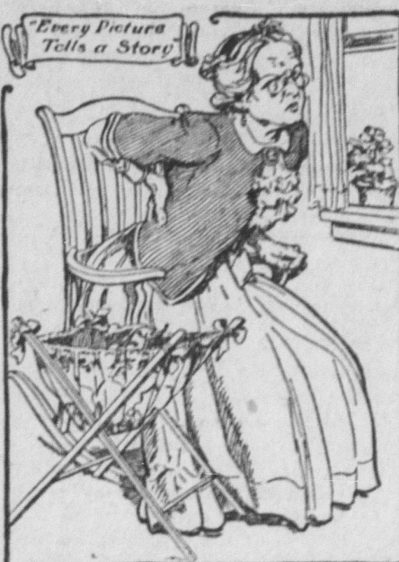
"I don't know what ails me."

Real torture begins when the uric acid forms into gravel or stone in the kidney, or crystallizes into jagged bits in the muscles, joints or on the nerve tubings. Then follow the awful pains of neuralgia, rheumatism, gout, sciatica, neuritis, lumbago or kidney colic.