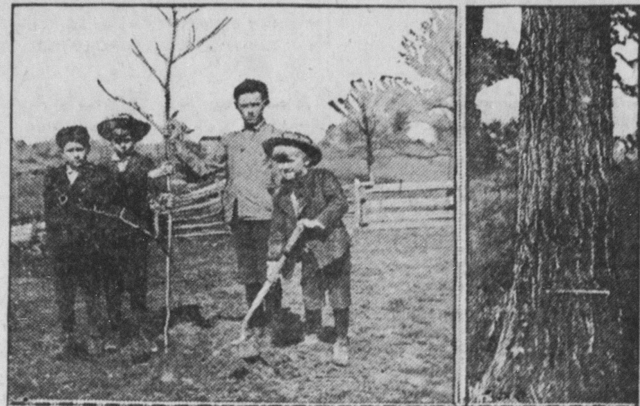
These Boys Will Take an Interest in This Tree, and it Will Grow as They Grow.